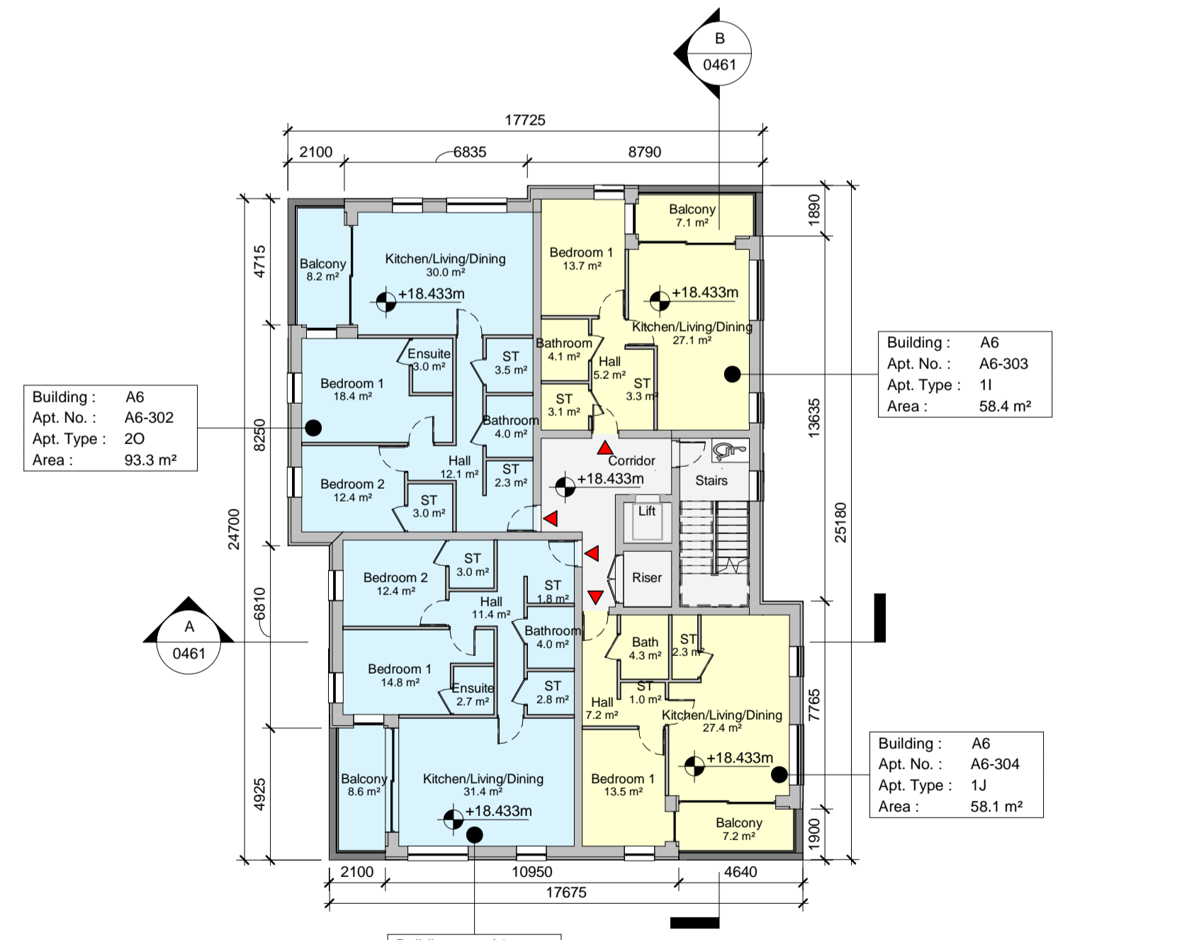
4 Third Floor Plan 1 : 200