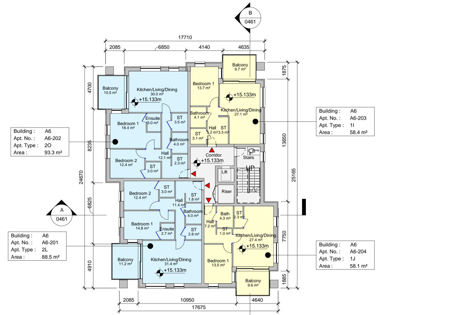
3 Second Floor Plan 1 : 200