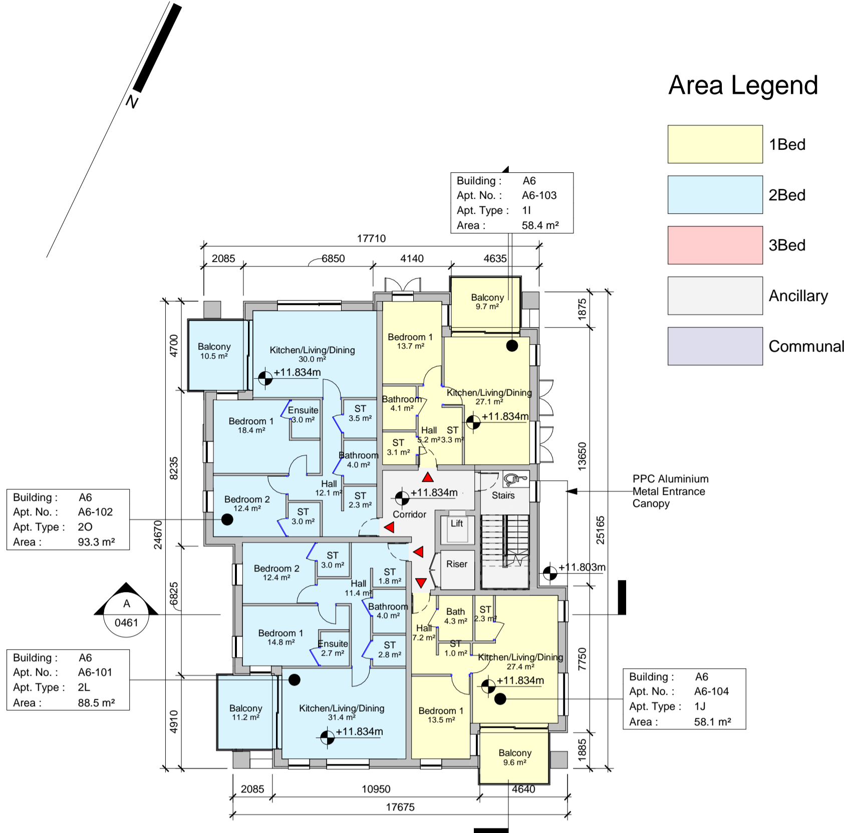
2 First Floor Plan 1 : 200

Blandcrest Site 7.247 hectare (17.907 acres)